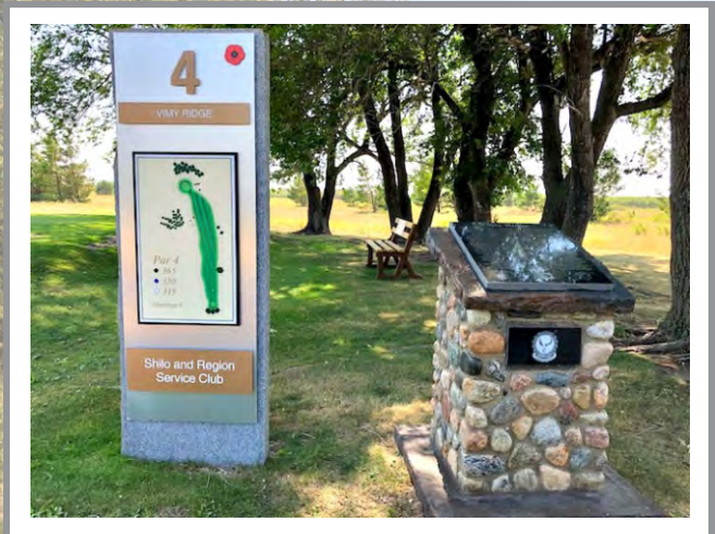
Memorial marker & Plinth